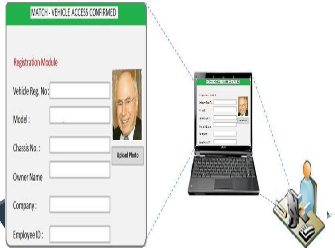
Fig 1.6 Registration And Alert Application