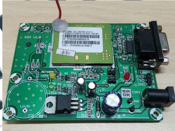
1.3 Gsm Modem