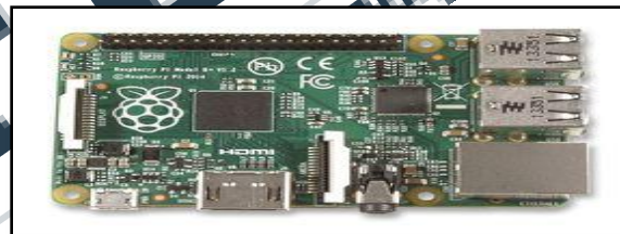
a) Raspberry pi: